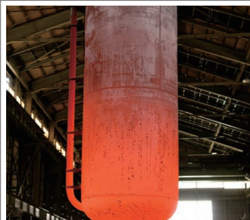
Red hot outer cylinder

capacity for two of its main products, titanium sponge and titanium ingots*.